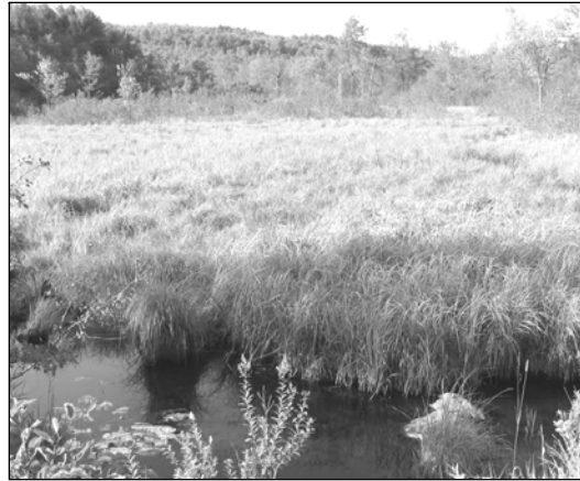
Meadow Brook, bordering 55 acre Sturtevant Meadow Brook Forest Conservation Easement

KLT will be responsible for monitoring the Meadow Brook and Sturtevant Farm easements and providing exceptional public recreational opportunities across these lands. We need your help to ensure that these lands are protected forever and available for the public to enjoy. The Trust needs to raise $10,000.00 in stewardship funds to meet this responsibility in perpetuity.