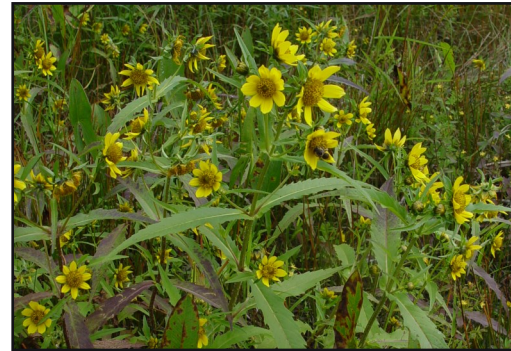
Bidens cernua - nodding beggar ticks